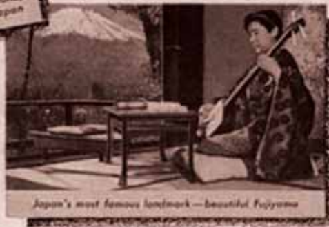
Japan's most famous landmark—beautiful Fujiyama

See your authorized travel agent for cruise details