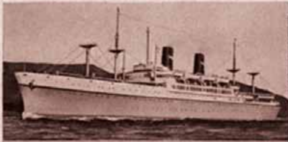
The magnificent new S. S. President Cleveland sails for the Orient