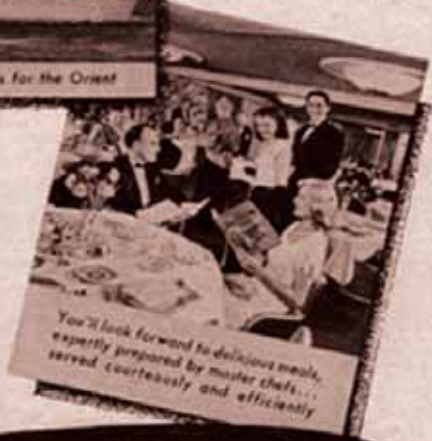
You'll look forward to delicious meals, expertly prepared by master chefs... served courteously and efficiently

Your cruise to the Orient will be an experience you will always remember. You may relax in the comfort of air-conditioned staterooms, enjoy superb service aboard your great new liners. And you'll marvel at the beauty of Hawaii, the fascination and mystery of Japan and China, the interesting sights of the Philippines.